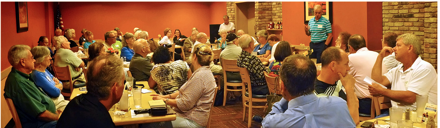
August 20th PCC Meeting

The Pensacola Camellia Club is hosting the American Camellia Society Annual Convention - Dec. 11 thru Dec 14, 2013. We would encourage as many members from our Pensacola club as possible to attend the convention. As an incentive we are offering to our P.C.C. members a $10 discount for early registration. The regular registration including programs, field trips, meals, and banquets is $250 per person. Early registration to the public is $225 by October 15, 2013. Pensacola Club members get an additional $10 discount if they pay by Oct 1st ... only $215. Please try to attend; it will be great fun. You are encouraged to attend all functions but not required to. Even if you only attend half of the events it is still a very good value. Please pay the Pensacola Camellia club directly and we will forward the money on to A.C.S.