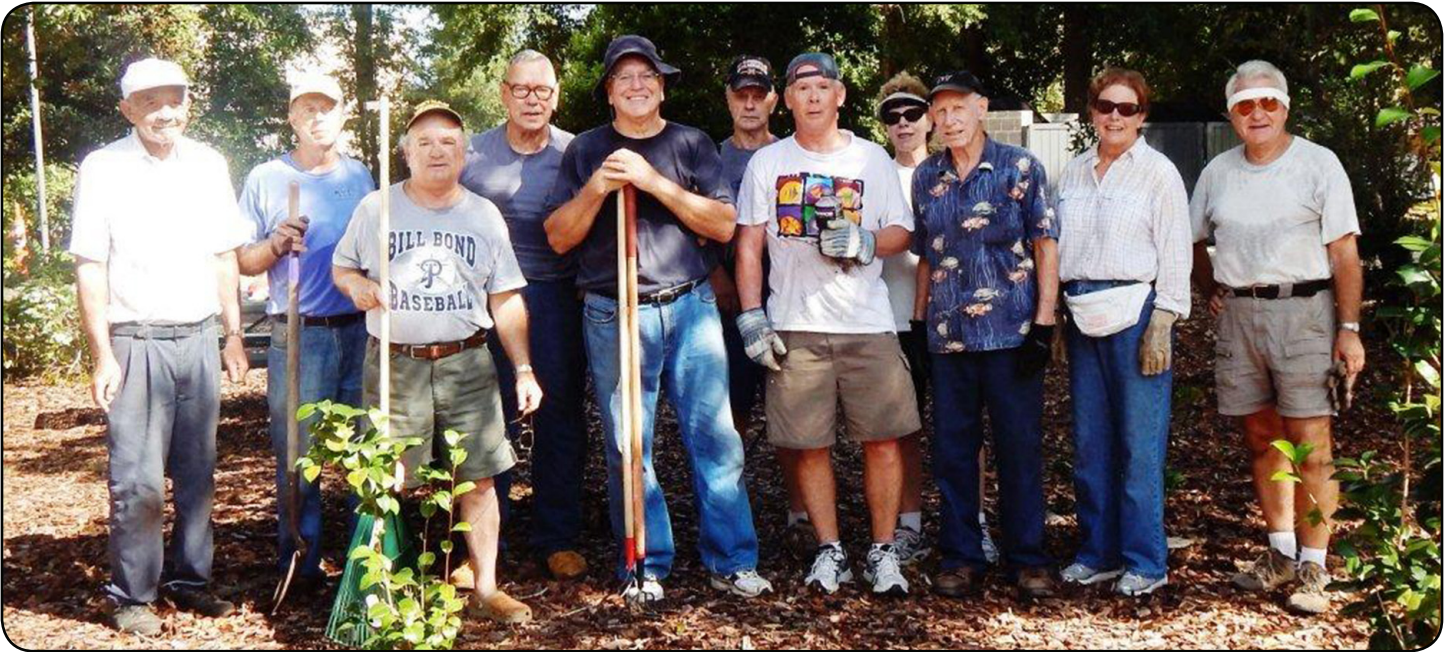
Friday, October 4 - UWF Garden