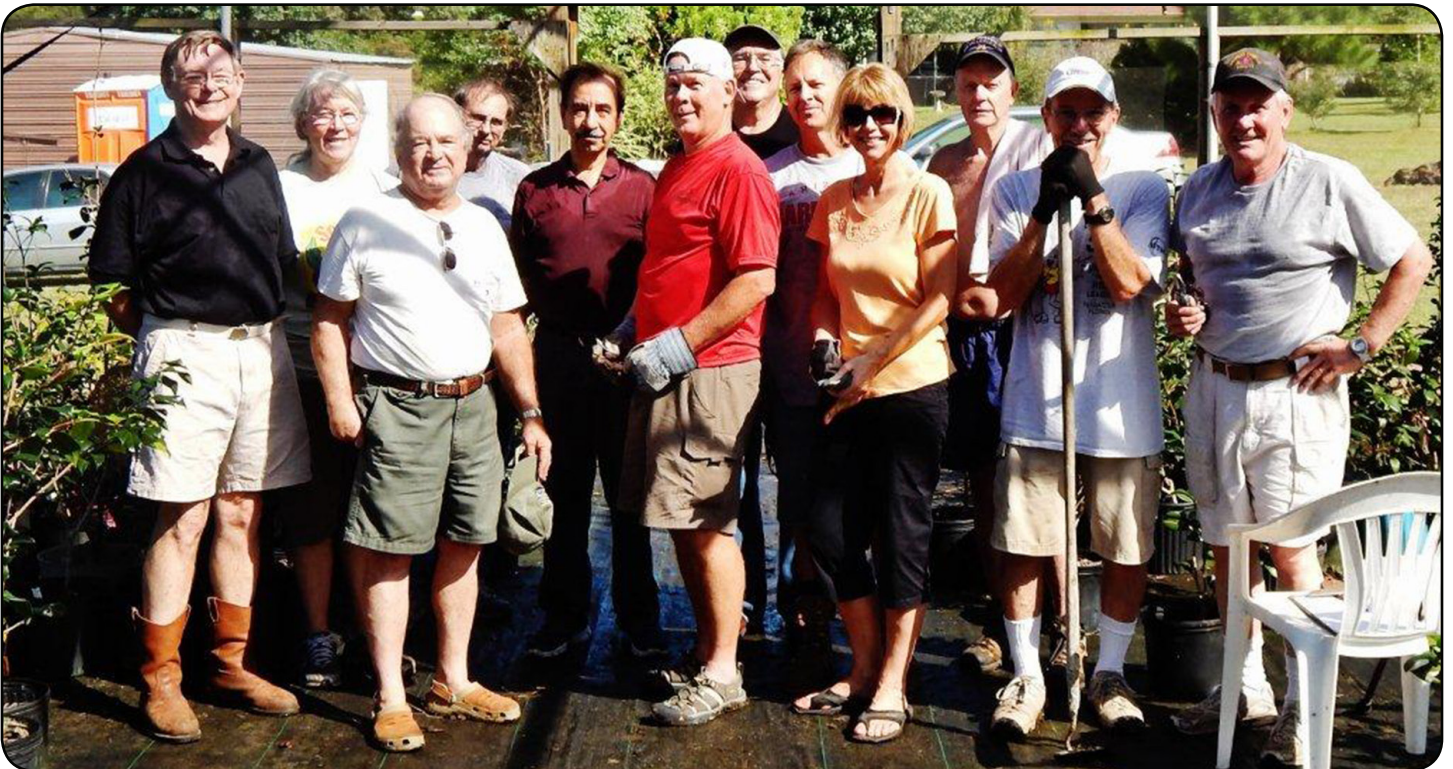
Saturday, October 5 - Shade House