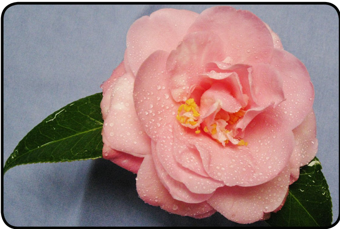
Unnamed Chance Seedling

The Pensacola Camellia Club is hosting the American Camellia Society Annual Convention - Dec. 11 thru Dec 14, 2013. We would encourage as many members from our Pensacola club as possible to attend the convention. The regular registration including programs, field trips, meals, and banquets is $250 per person. Early registration to the public is $225 by October 15, 2013. Please try to attend; it will be great fun. You are encouraged to attend all functions but not required to. Even if you only attend half of the events it is still a very good value. Individual events and meals are available and priced on a per item basis. Please pay the Pensacola Camellia club directly and we will forward the money on to A.C.S.