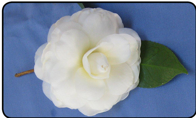
C. Japonica, variety White By The Gate