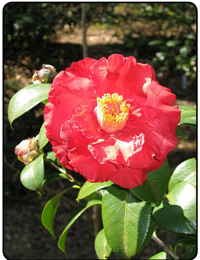
C. Japonica, variety Don-Mac