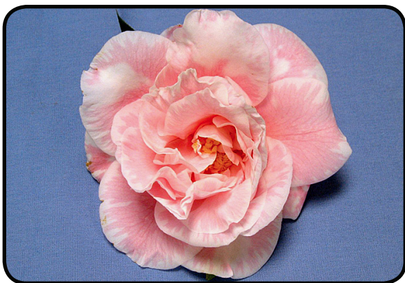
C. Japonica, variety Betty Sheffield Silver