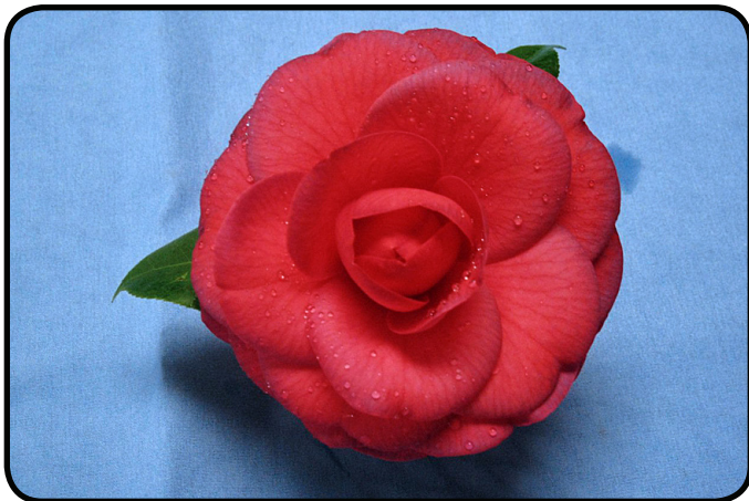
Mathotiana "Purple Dawn"