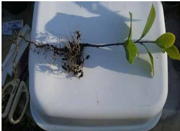
3: Untrimmed rootstock.