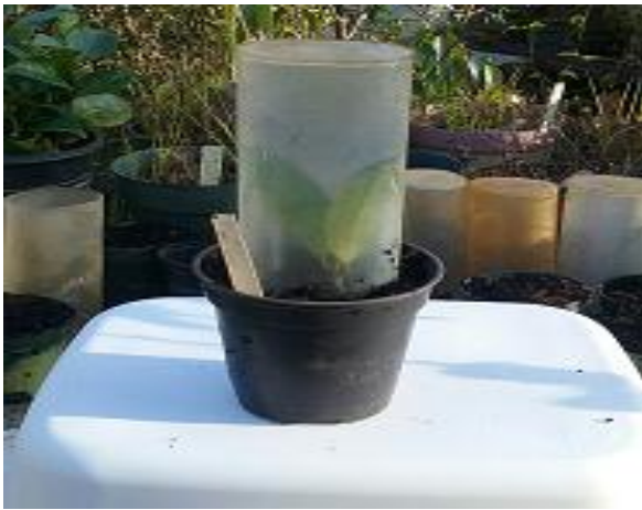
9: Completed operation.