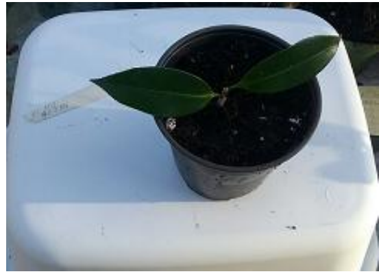
8: Rootstock planted.