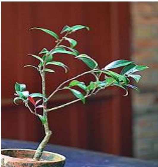
11: Night Rider, graft is just above the pot edge.