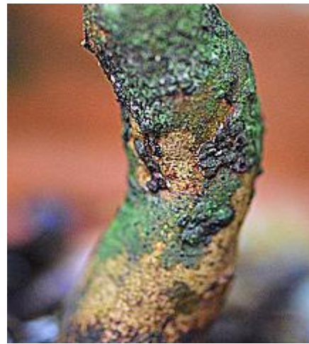
10: Night Rider, three year graft.