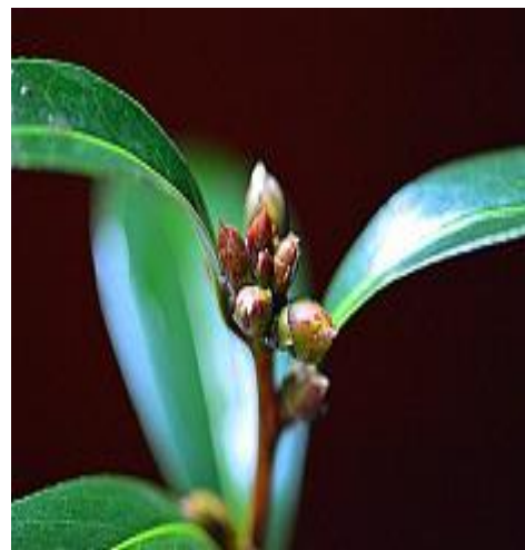
12: Flower buds.