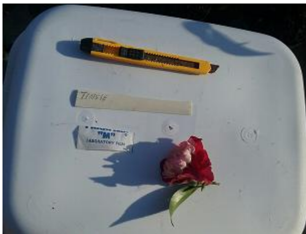
5: Scion, parafilm, label, exacto.