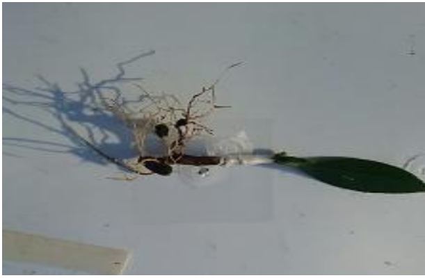
7: Scion in place & sealed with parafilm.