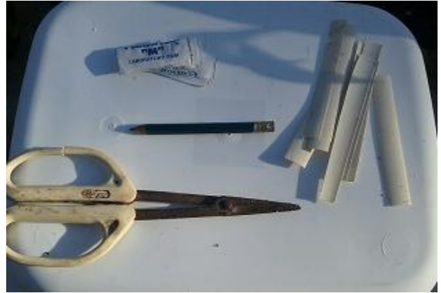
2: Parafilm, labels, no#.2 pencil for writing label, scissors.