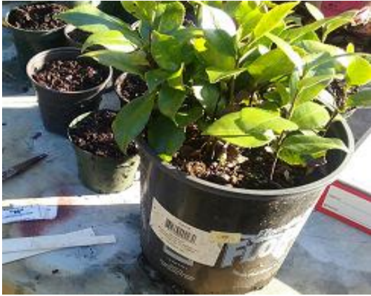
1: Pot of rootstock, pots of soil.