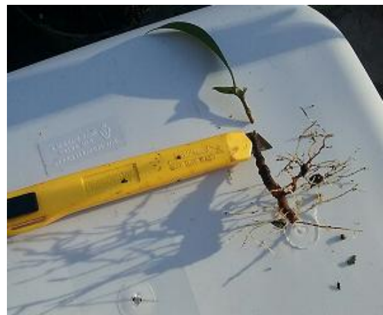
6: Rootstock trimmed, split & scion ready to be placed.