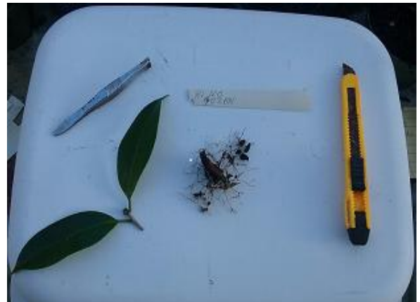
4: Trimmed rootstock, scion, tweezers & level.