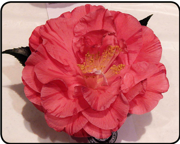
C. Japonica, Variety: Lady Laura, a Pensacola variety.