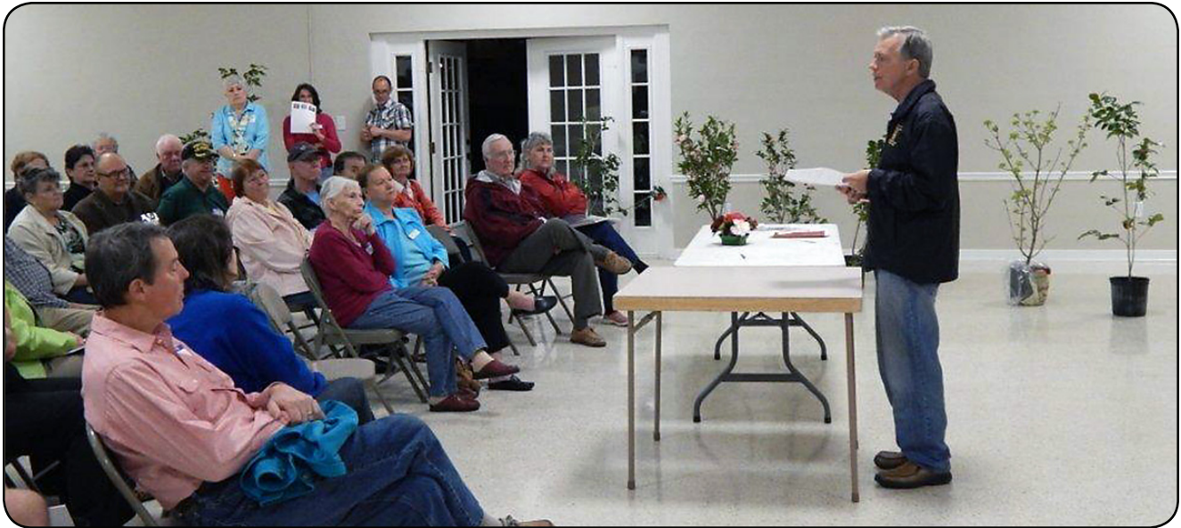
March 18, 2014 PCC membership meeting.