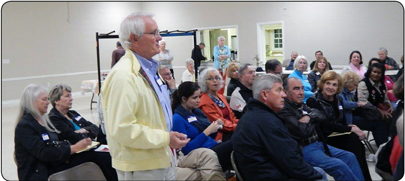
March 18, 2014 PCC membership meeting.