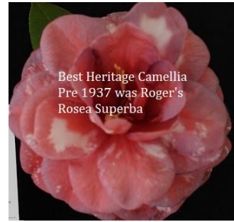
Best Heritage Camellia Pre 1937 was Roger's Rosea Superba

Location: Garden Center , 6:30pm for social, 7:00 pm program.