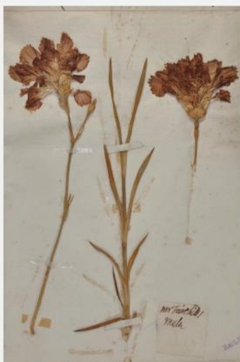
Fairchild's Mule