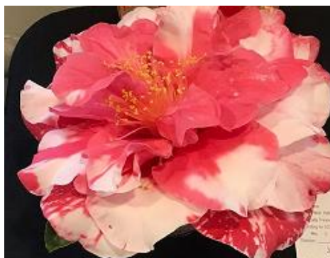
Edna Bass Variegated