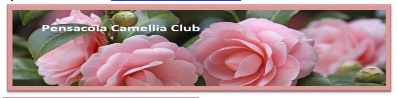
April 2019 Newsletter www.PensacolaCamelliaClub.com or like us on Face book.