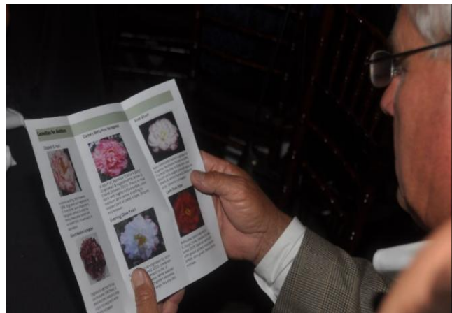
Plant auction = $525