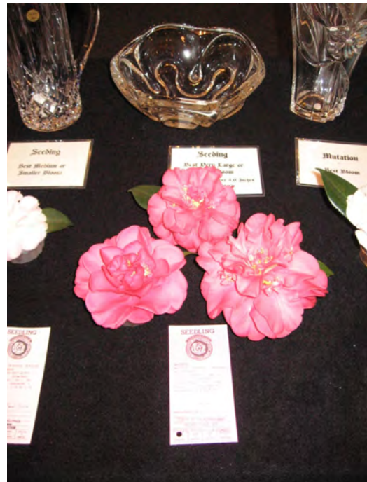
2009 Pensacola Camellia Show